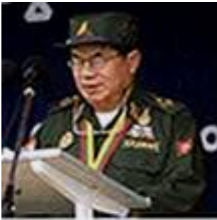
Name - Gen_ Hso Ten Sentence - Detention Current Prison - Insein